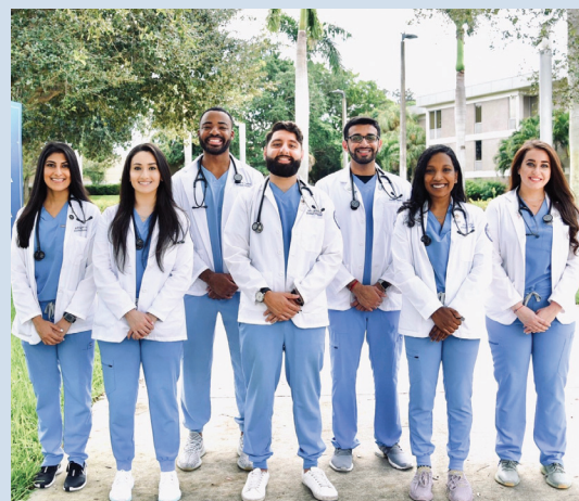
Class of 2023 Class Board