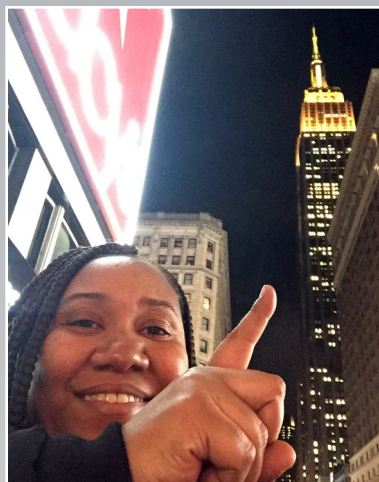
Enjoying the sights in New York City.