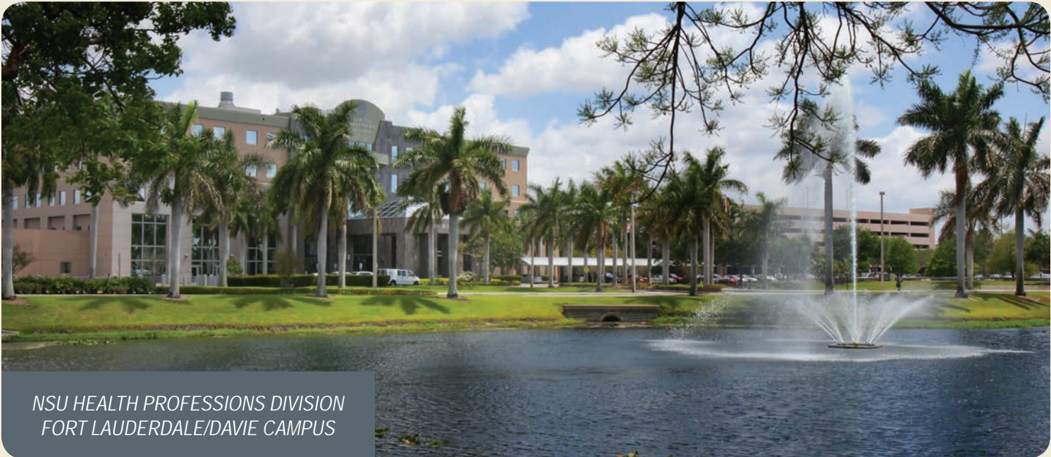
NSU HEALTH PROFESSIONS DIVISION FORT LAUDERDALE/DAVIE CAMPUS

Nova Southeastern University's Lifelong Learning Institute (LLI) provides a vibrant educational environment for mature adults in South Florida. Programs promote intellectual stimulation, physical well-being, and social growth that enrich the lives of its members and the community.