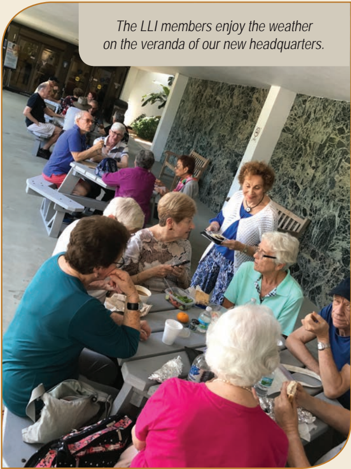
The LLI members enjoy the weather on the veranda of our new headquarters.