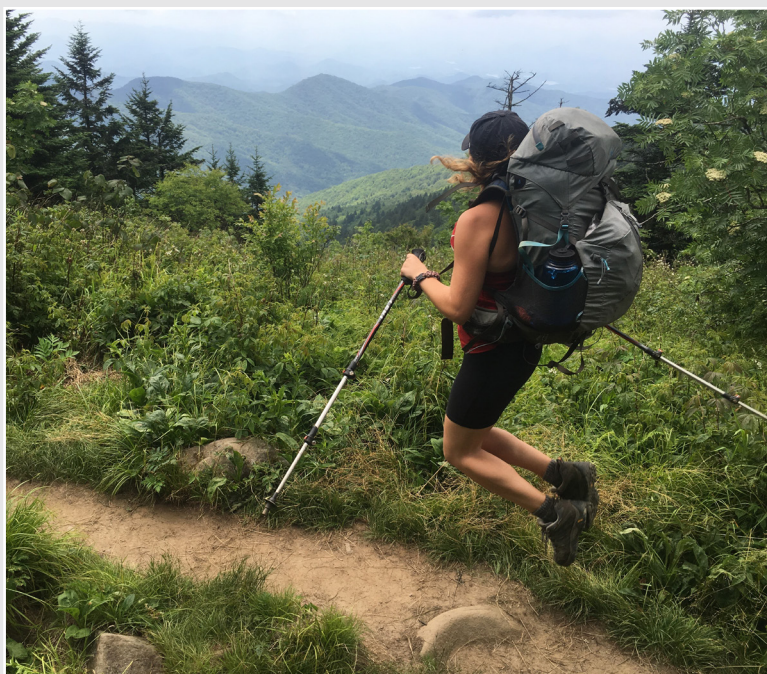
Hiking at sunrise