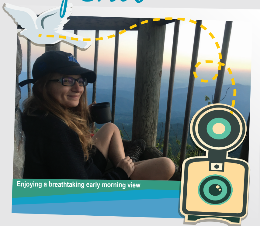
Enjoying a breathtaking early morning view