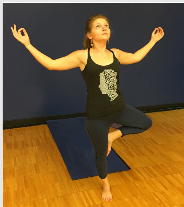
Doing a yoga tree pose