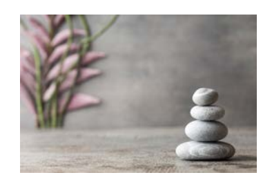
"My own prescription for health is less paperwork and more running barefoot through the grass." -Terri Guillemets

The Wellness Lunch Series was designed to help create a life of balance that honors all aspects of life: mind, body, and spirit. We hope these programs will foster interest in wellness and health and promote and provide added inspiration and practical wisdom that can easily be implemented into your daily professional life. The Wellness Lunch Series is a collaborative initiative from the Department of Medical Education and Integrative Medicine supporting faculty and staff to fulfill commitments to scholarly and cutting-edge educational programs. Our invited guest speakers will continue to offer interactive lectures on health and wellness so you can continue to learn how to reduce stress, eat well, and understand healing modalities that inspire your heart and your spirit. This lunchtime series has been very popular for the last few years and has added an innovative dimension to the Faculty Development Program. We will continue to offer programs on wellness that include all aspects of a healthy self: emotionally-psychologically-physically-and spiritually. It is our hope that you will be inspired and motivated and healthy!